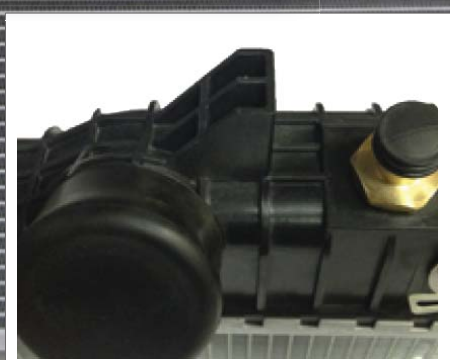
Heavy-ribbed tanks provide extra durability.