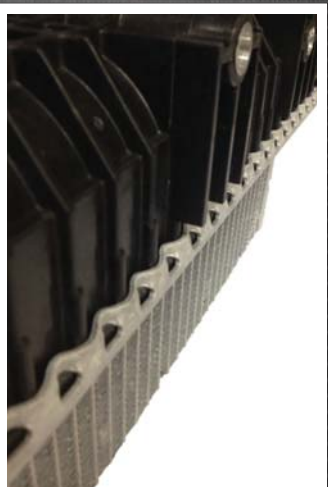
Ribbon-style tab headers for standard applications.