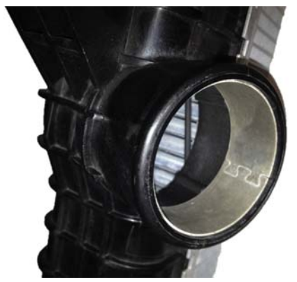
Inner steel hose connection reinforcements stand up to stresses.