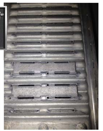
Internal corner tube reinforcements provide added strength and durability.