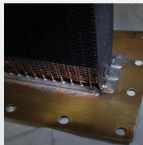
Under header mounted side piece for extra corner strength