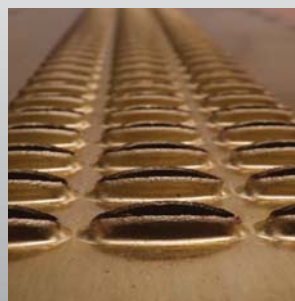
Enhanced tube collar height for superior tube header bond