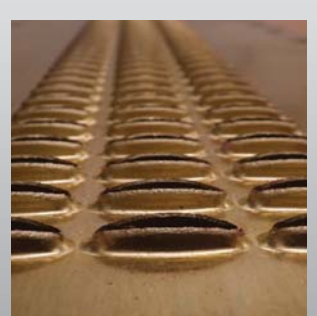
Enhanced tube collar height for superior tube header bond